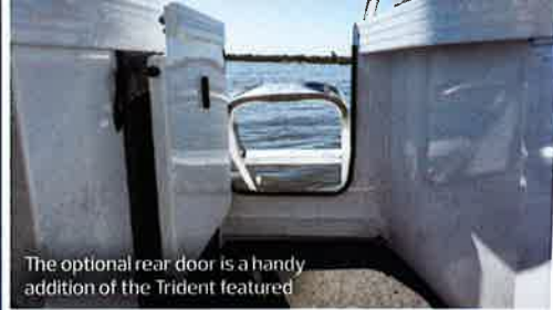
The optional rear door is a handy addition of the Trident featured

The build is initiated by cutting and stretch forming the 5mm bottom and 3mm topsides before it is taken in for the first stages of welding. Once the outer shell is formed, the hull then receives its 'gibs'. These are alloy struts that span every 400–500mm along the inside of the hull to ensure a rigid construction and a smooth ride. With all the 'gibs' modelled off the single template, uniformity is achieved throughout the whole range and the Quintrex Blade Hull is formed.