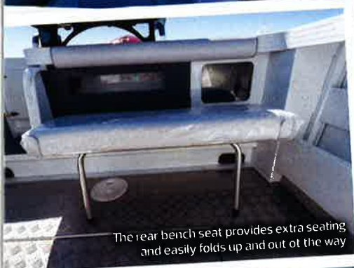
The rear bench seat provides extra seating and easily folds up and out of the way