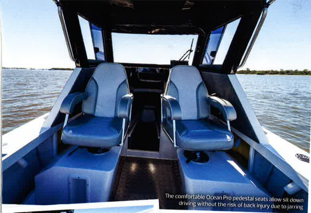
The comfortable Ocean Pro pedestal seats allow sit down driving without the risk of back injury due to jarring