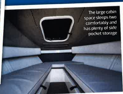
The large cabin space sleeps two comfortably and has plenty of side pocket storage