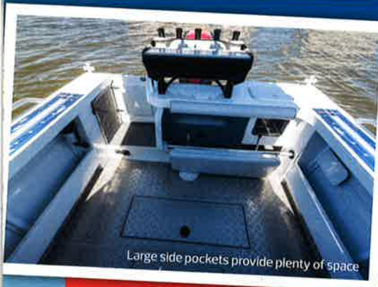
Large side pockets provide plenty of space

The 610 Trident HT offers buyers an exceptional package capable of tackling some serious offshore weather yet is more affordable and accessible with most mid-sized vehicles capable of towing it. ⚓