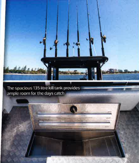
The spacious 135 litre kill tank provides ample room for the days catch