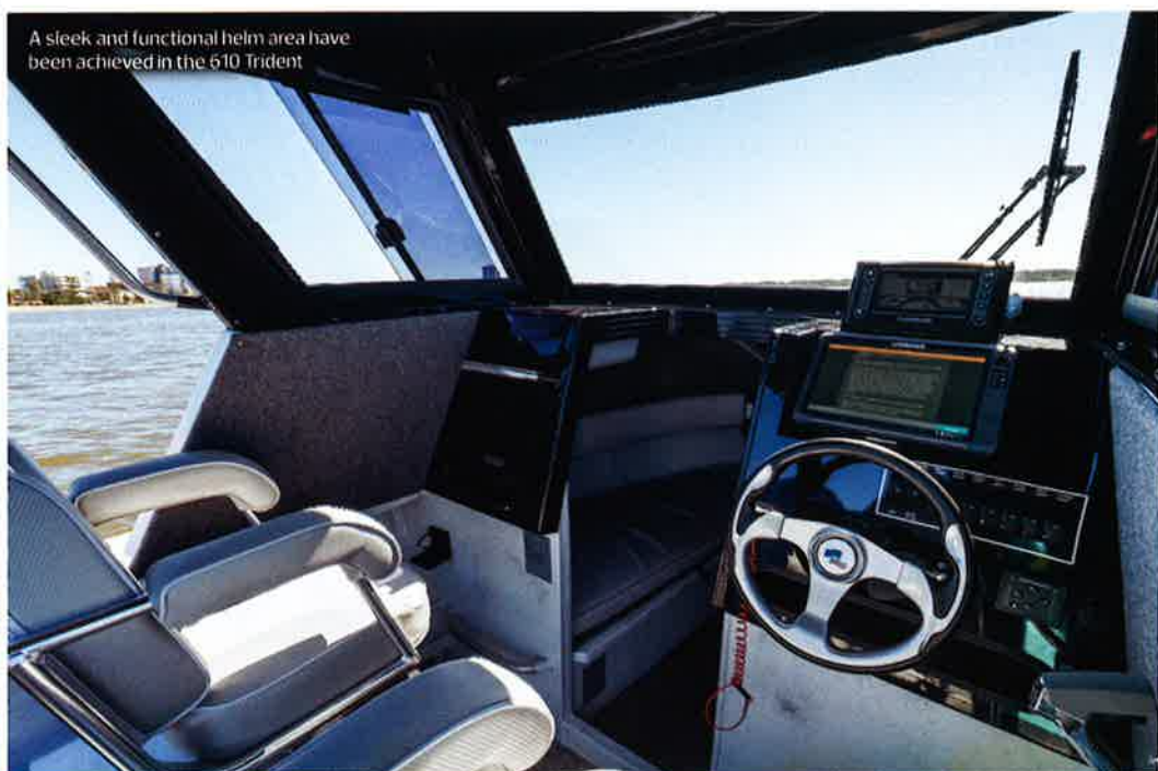
A sleek and functional helm area have been achieved in the 610 Trident

The huge windscreen is the big ticket item at this helm making the whole area feel a lot larger. Unlike some manufacturers, Quintrex have realised that vision is the key to many offshore anglers success and have supplied nearly unobstructed, 180 degree vision. Well done!